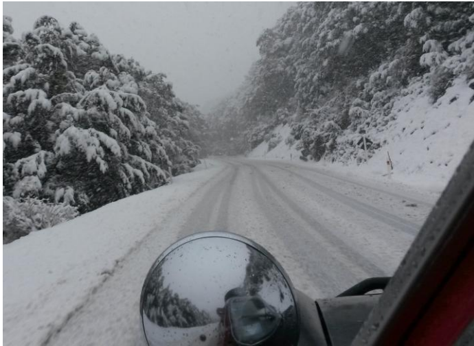
A Snowy Lewis Pass