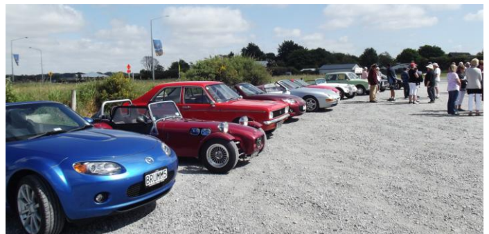
Already for a day's cruising to Rakaia Huts