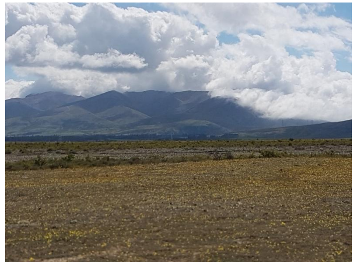
A scene that you will enjoy on the 2018 Marathon

Please advise us if your email address is about to or has already changed.