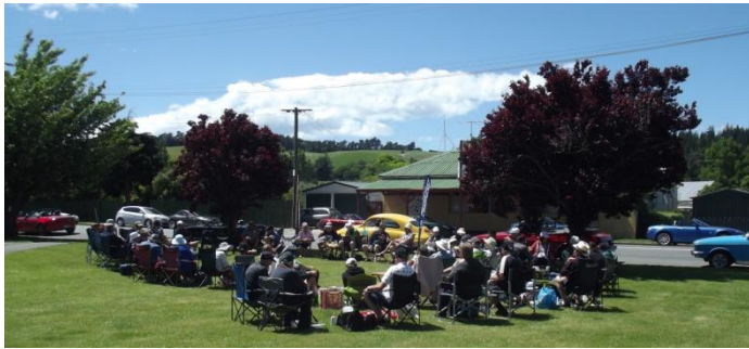
Lunch time in Waiau

Our meeting place was beside the Ashley River in Rangiora. What a wonderful turn out – Newer cars – older cars - newer members and older members.