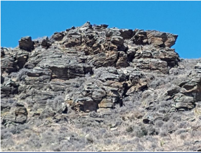
Another stunning sight you will see on the Marathon.