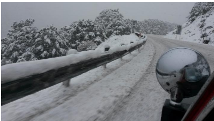
Nearing the Top of the Lewis