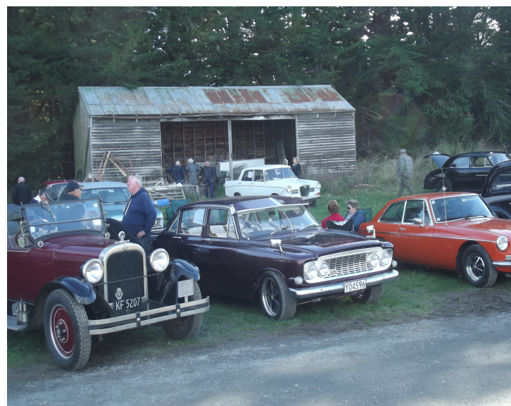
A good cross section of the cars and sheds at the Ashburton Rotary Event

Barhill. In the early days it was a busy village styled on the villages in England. A Church and Hall remain – beautiful English trees and the odd house or two. Our destination was a cropping farm on the banks of the Rakaia River near Highbank – it was a bit of a challenge to get all 225 cars parked! It was great to see the variety of cars both older and newer. After the prize giving we headed to Rakaia for our coffee & cake and it was good to have Norm Fisher join with us. Gill Peters