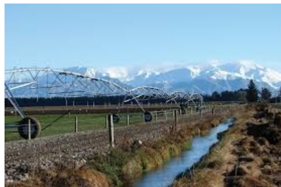
A glorious day for farming in Mid-Canterbury

The day for the Run was surprisingly pleasant with some much needed sun after a very dull and murky week. We decided on Plan B once again because of this. Ten cars arrived and we drove to Darfield through Coalgate and Hororata and on to Substation